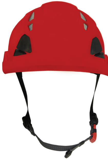
(Front with Chin Strap)